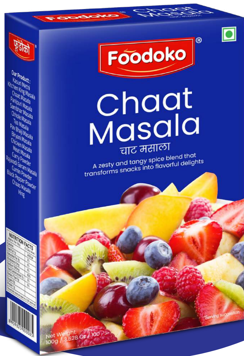
CHAAT MASALA Available Sizes : 50g, 100g