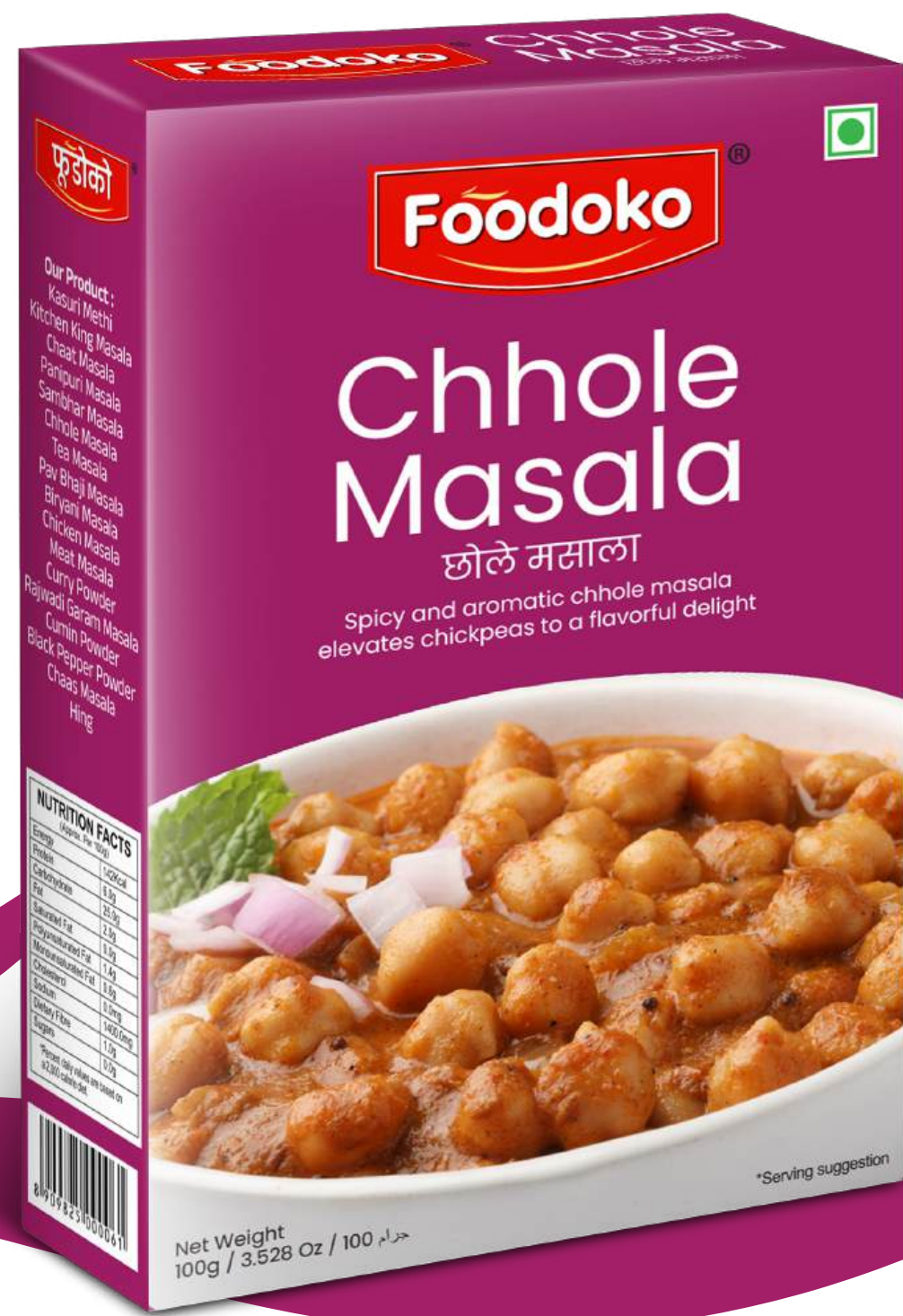
CHHOLE MASALA Available Sizes : 50g, 100g