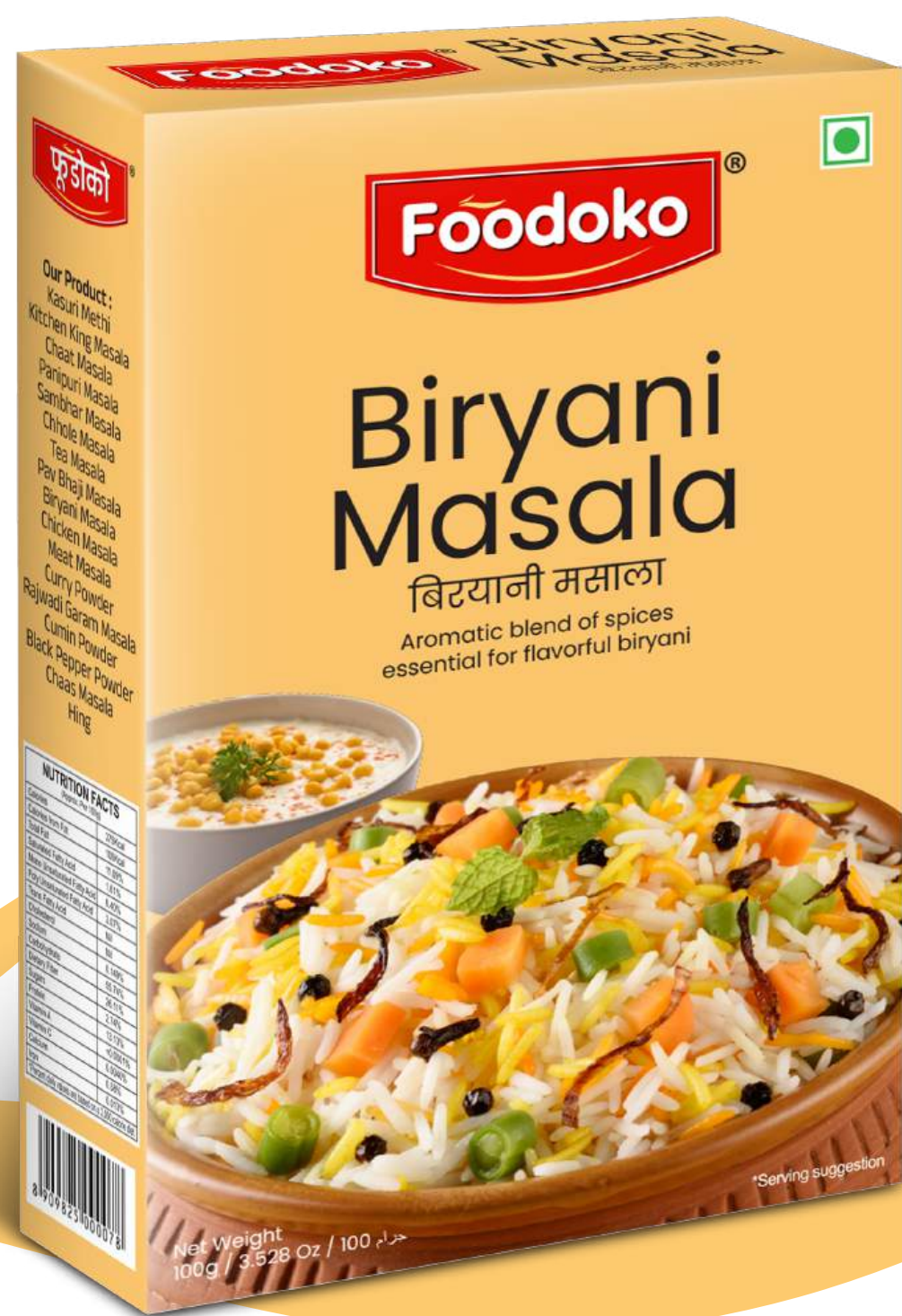
BIRYANI MASALA Available Sizes : 50g, 100g