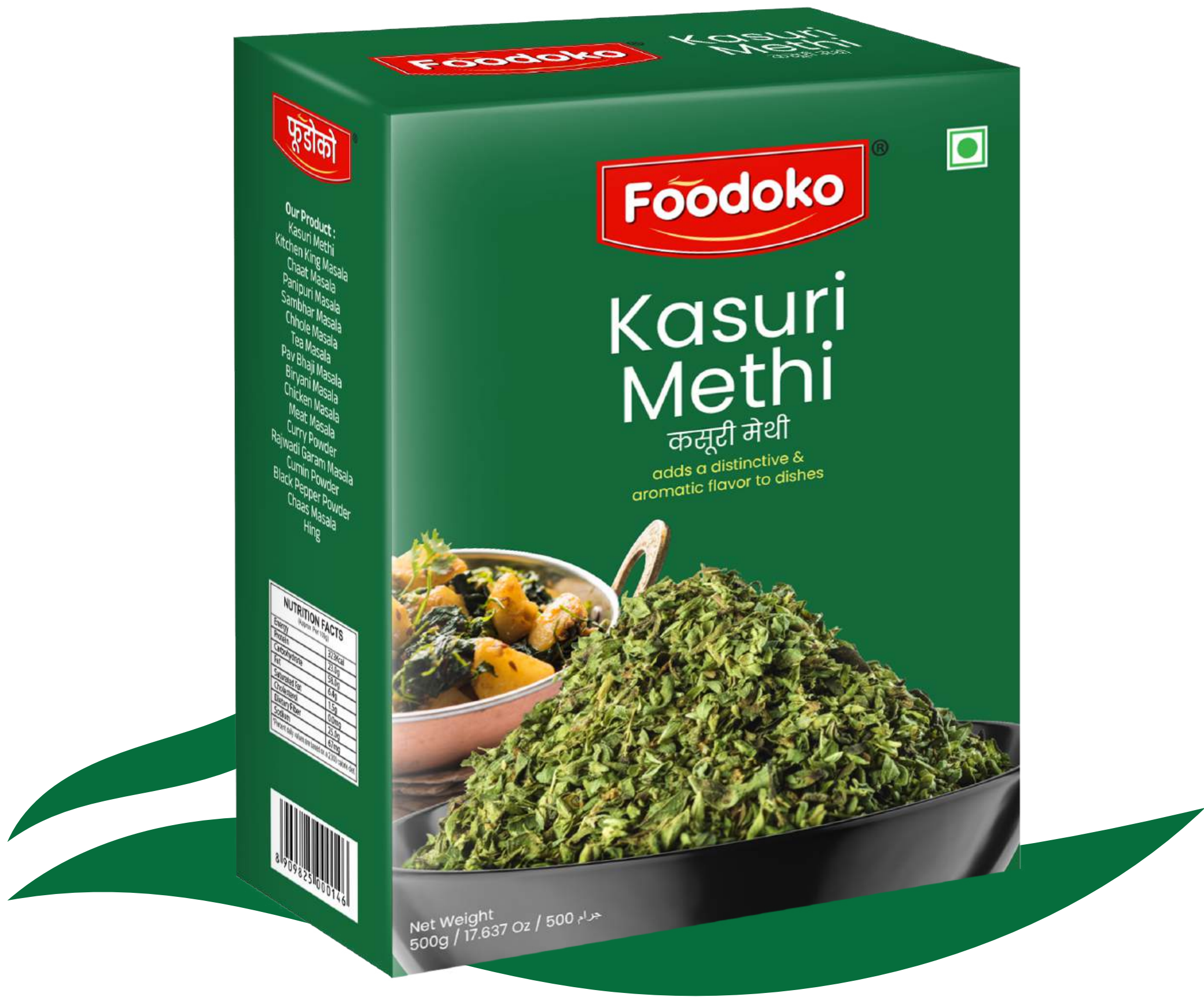
KASURI METHI Available Sizes : 100g, 500g