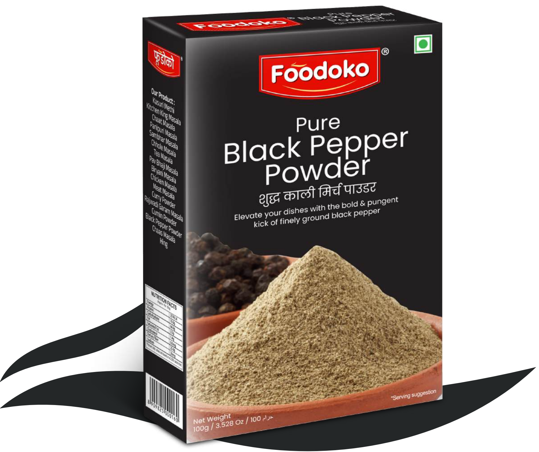
PURE BLACK PEPPER POWDER Available Sizes : 50g, 100g