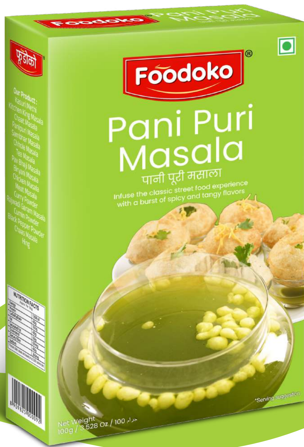
PANI PURI MASALA Available Sizes : 50g, 100g