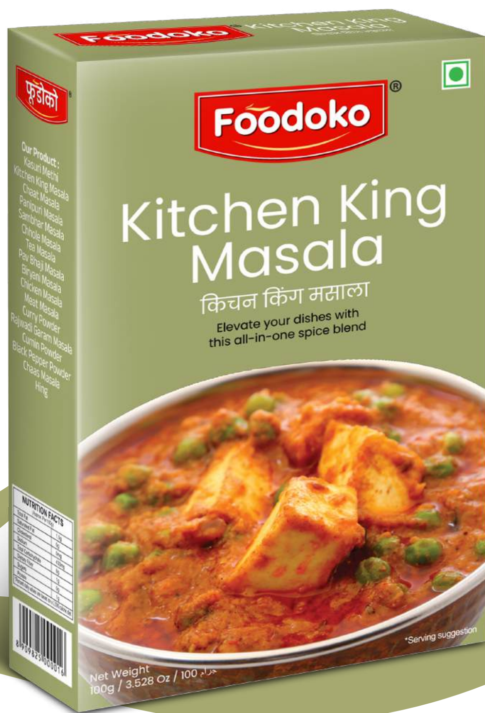
KITCHEN KING MASALA Available Sizes : 50g, 100g