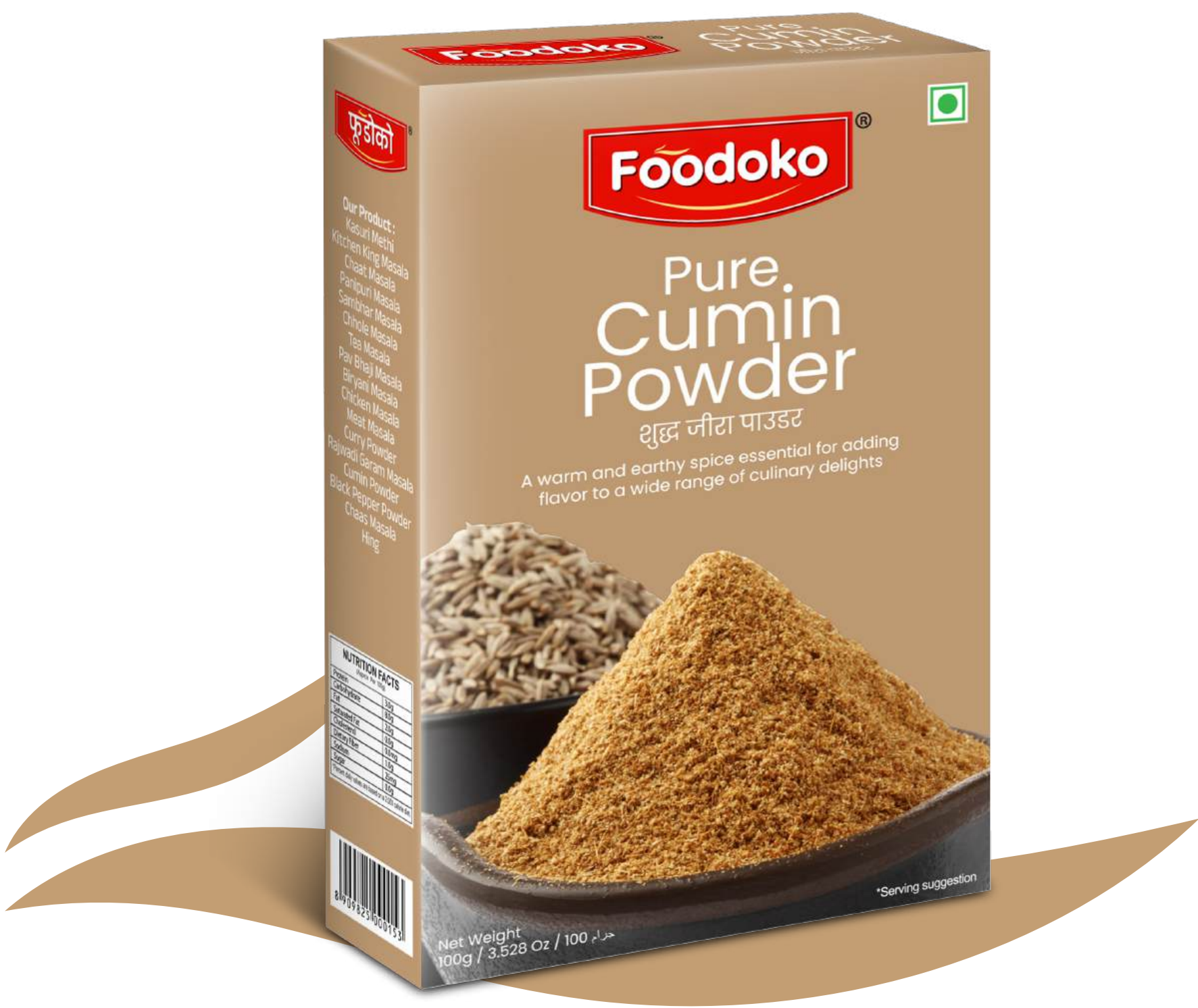
PURE CUMIN POWDER Available Sizes : 50g, 100g