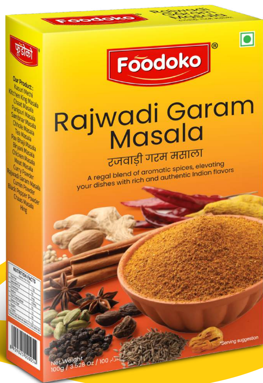
RAJWADI GARAM MASALA Available Sizes : 50g, 100g