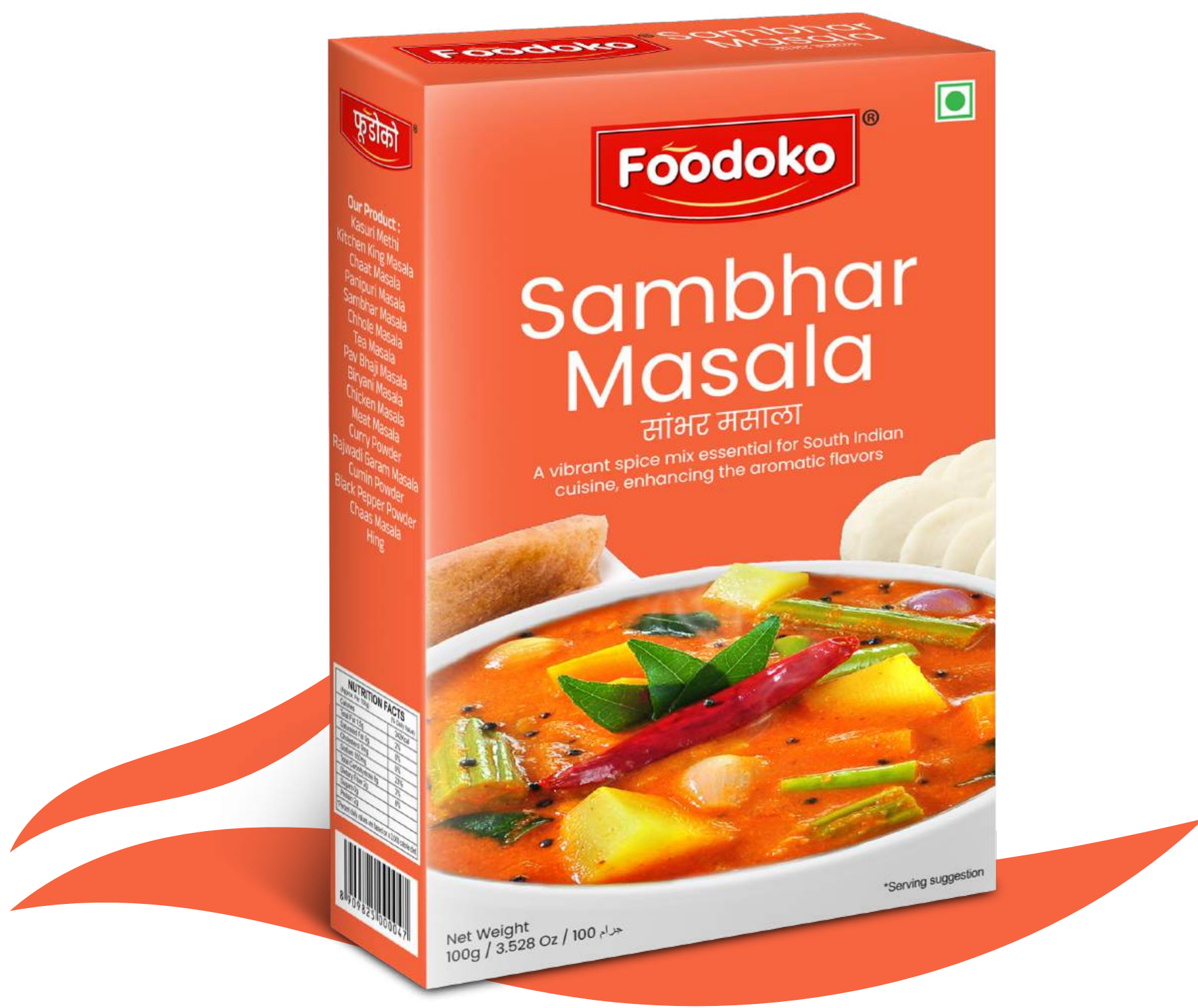
SAMBHAR MASALA Available Sizes : 50g, 100g